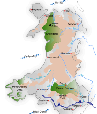
This map shows the rivers and national parks situated within

A compass is an instrument that helps to direct you. The four main points on a compass are north, south, east and west