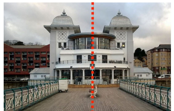
The Pavilion in 2013

The Pavilion has a line of symmetry down the middle making the building symmetrical.