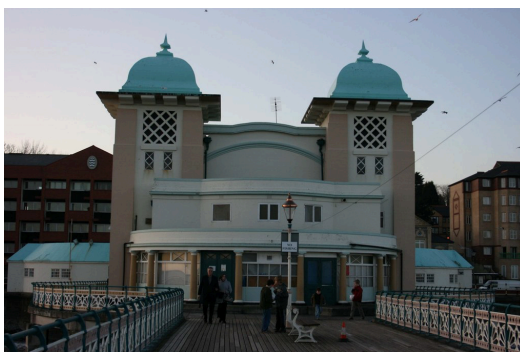
The Pavilion in 2009

The Pavilion has a line of symmetry down the middle making the building symmetrical.