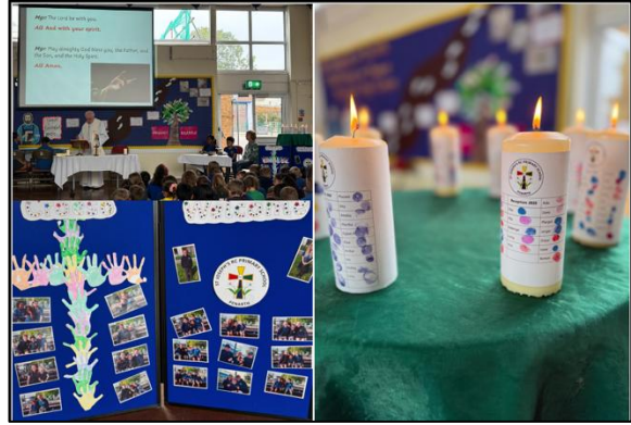
On Monday, we celebrated our Welcome Mass. The theme of our Mass was, 'Journeying in Faith, Walking with Hope, Guided by Love'