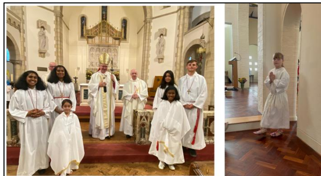
Many of this year's First Holy Communion children have begun altar serving in Church- we are so proud of them!